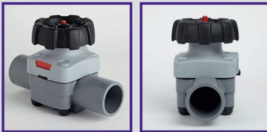
UNION ENDS, FPM DIAPHRAGM AVAILABLE – PRICES ON APPLICATION